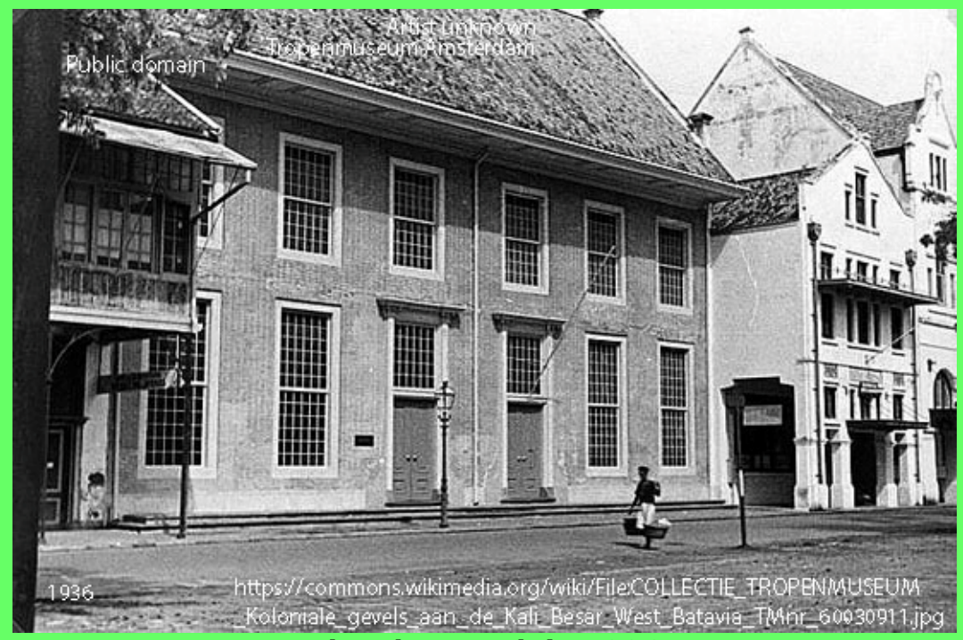
1b Toko Merah in 1936