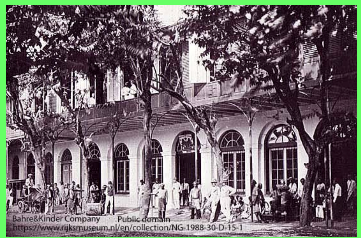
5 The southern corner of Jalan Kopi and Kali Besar Barat, circa 1860 The office of the German (from Bremen Town) company "Bahre&Kinder)