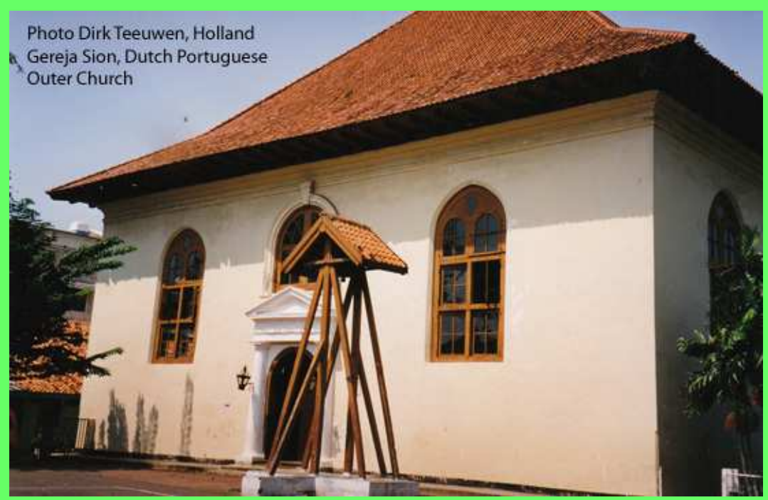
7 Gereja Sion in 2006, built 1695