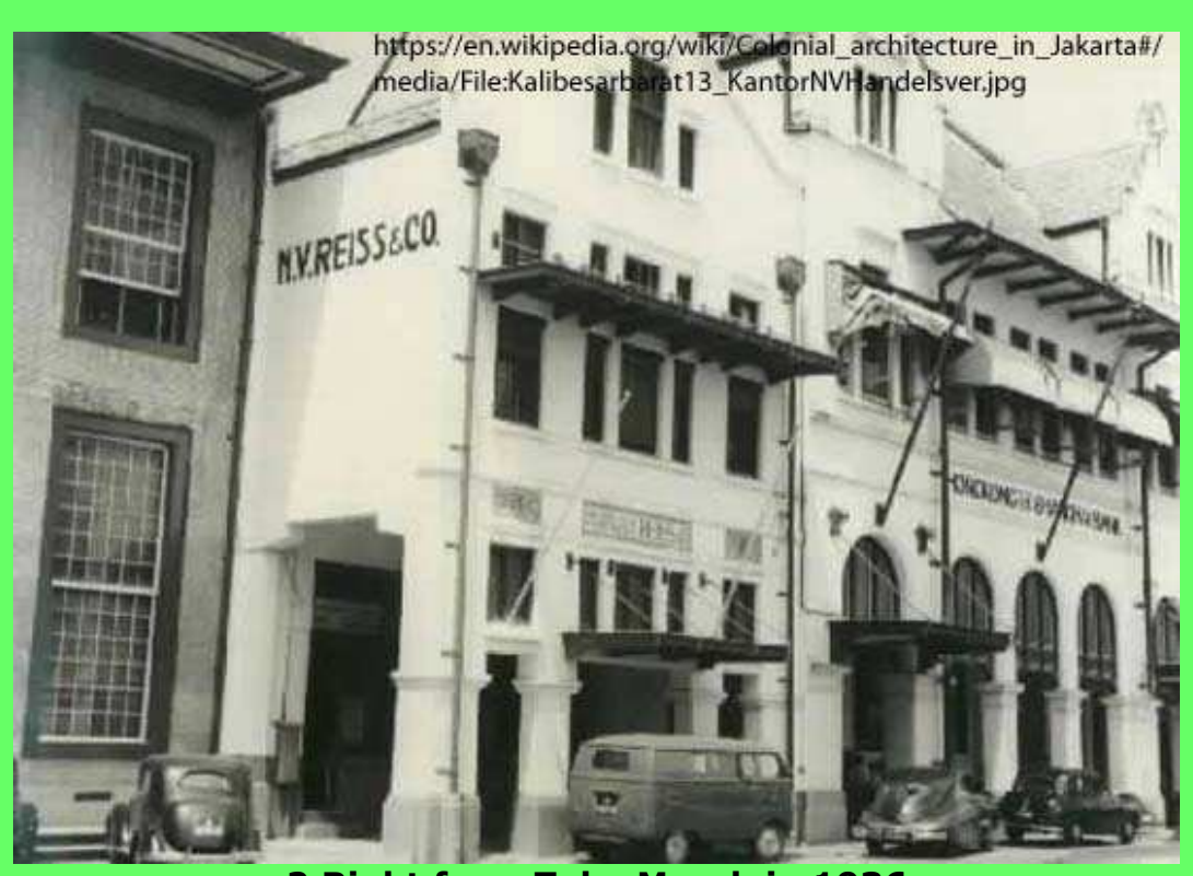
2 Right from Toko Merah in 1936