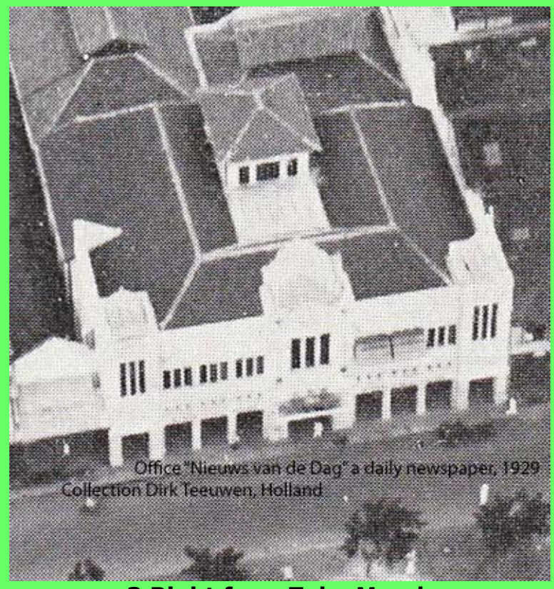
3 Right from Toko Merah Office of the colonial newspaper "Nieuws van de Dag", 1929