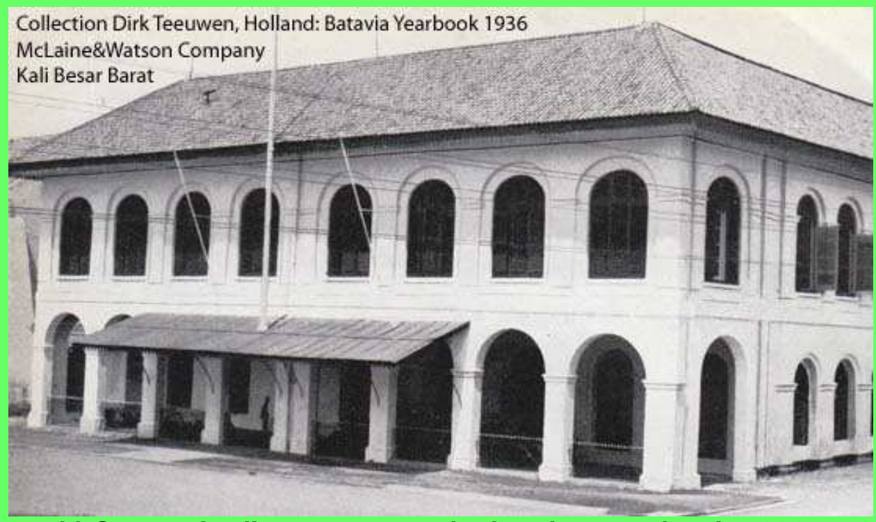
11 Corner of Kali Besar Barat and Jalan Tiang Bendera in 1936 The office of the McLaine and Watson Company