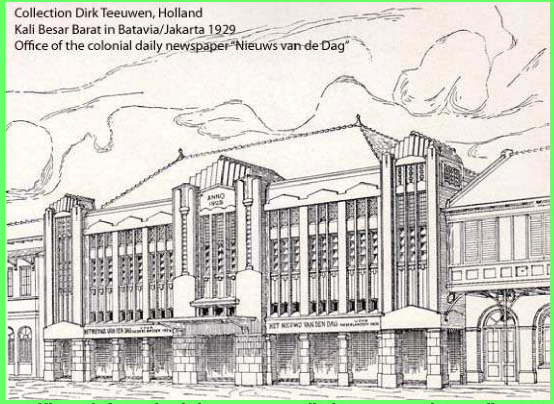
4 Office of the colonial newspaper "Nieuws van de Dag", 1929