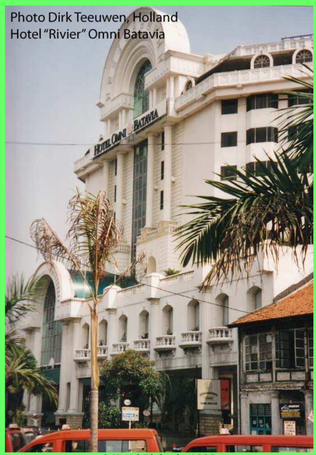
9 Hotel Rivier in 1998