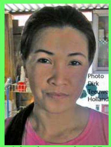
Asian elegance

Contents: Introduction Let's have a look at the pictures Pictures Tour Suggestion