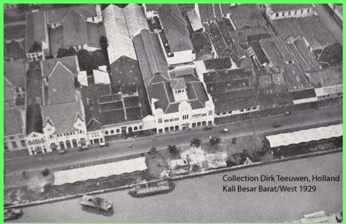
1 Part of Kali Besar West in 1929