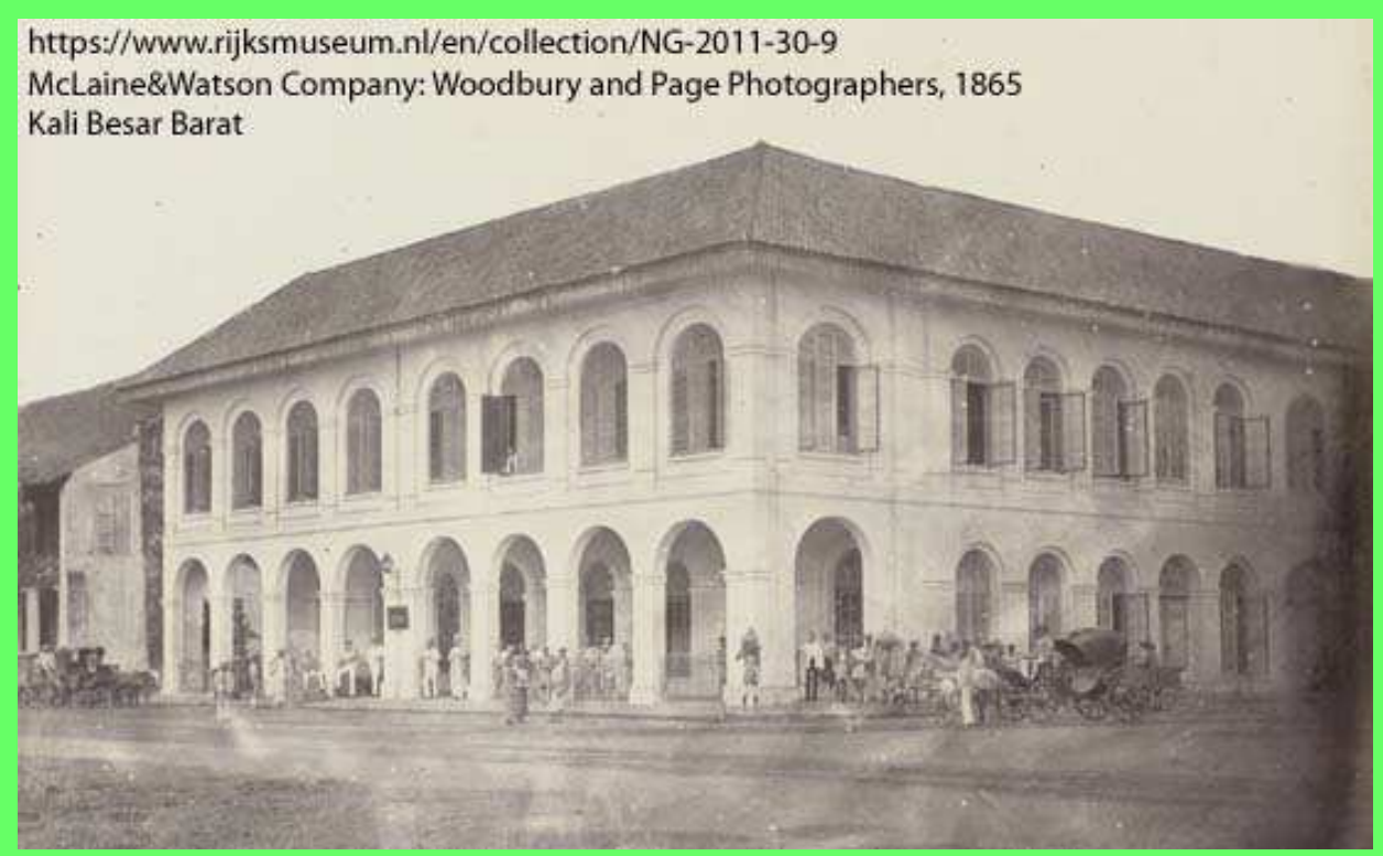
10 Corner of Kali Besar Barat and Jalan Tiang Bendera in 1865 The office of the McLaine and Watson Company