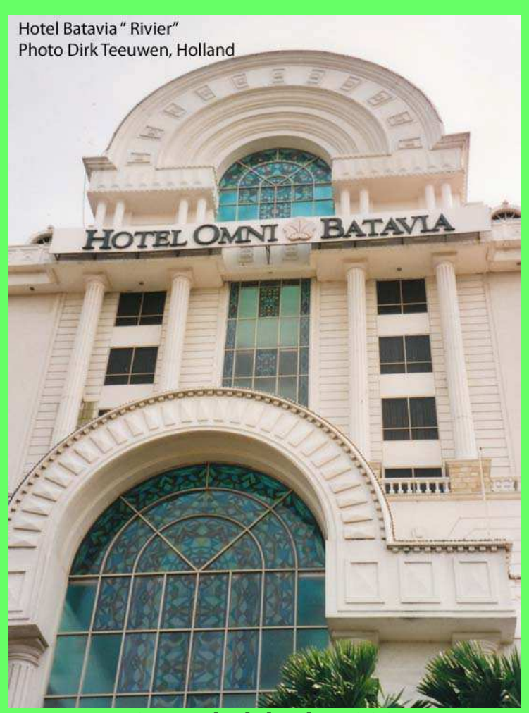
8 Hotel Rivier in 1998