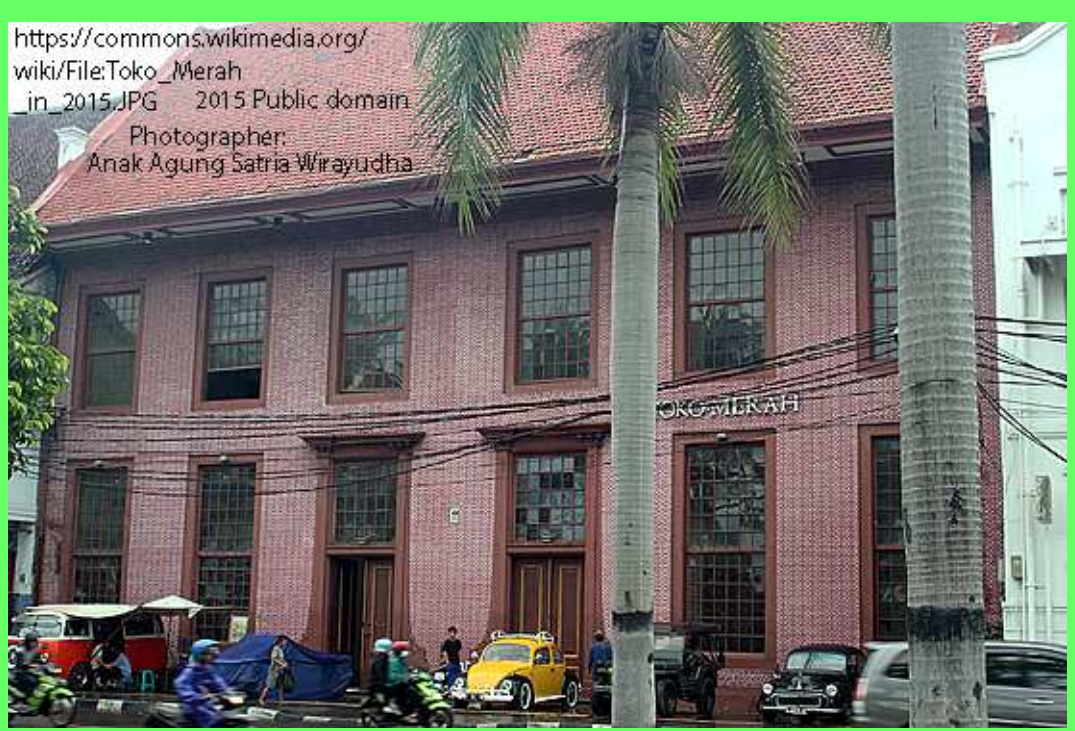
1a Toko Merah in 2015 Two Dutch houses from circa 1750